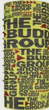
ORIGINAL ECOSTRETCH The Budd Group