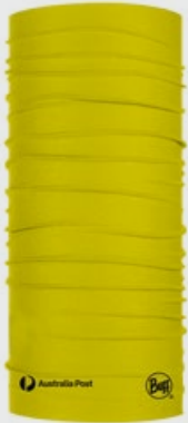
COOLNET UV Australia Post

Original Buff, S.A. is able to include in any standard product of the BUFF® Safety range a customized transfer printed with your company logo or brand name. The transfer are approximately 4x5cm, can be conventional, reflective or fire resistant and the price will vary depending on the shape, colours, size and quantity required.