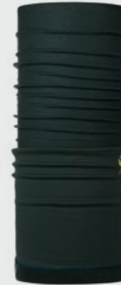
WINDPROOF Guardia Civil

BUFF® Safety products can be dyed to a colour of your specification. We are also able to add 3M Scotchlite™ retro-reflective stripes.