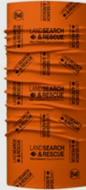
ORIGINAL ECOSTRETCH Land Search and Rescue New Zealand

BUFF® Safety neckwear is not only versatile in use but can also be fully customised with your own design, print or pattern. You can either provide the design or we can create one for you.