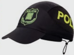
PACK CAP Mossos d'Esquadra