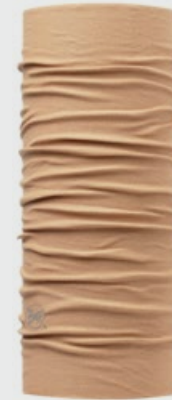
COOLNET UV Ejército del Aire (España)