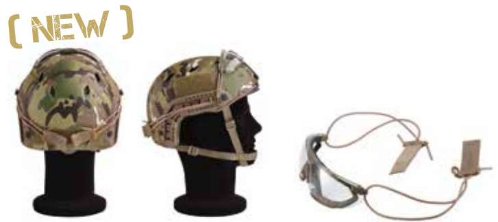
ELASTIC FIXTURE WITH BLACK OR TAN COLOUR SCRATCH (COMBFXS AND COMBFXN).

bFLEX The revolutionary B-Flex technology provides unique flexibility. Light, soft and fully pliable, the B-Flex bridge is fully adjustable and perfectly fits all faces thanks to its shape-memory material.