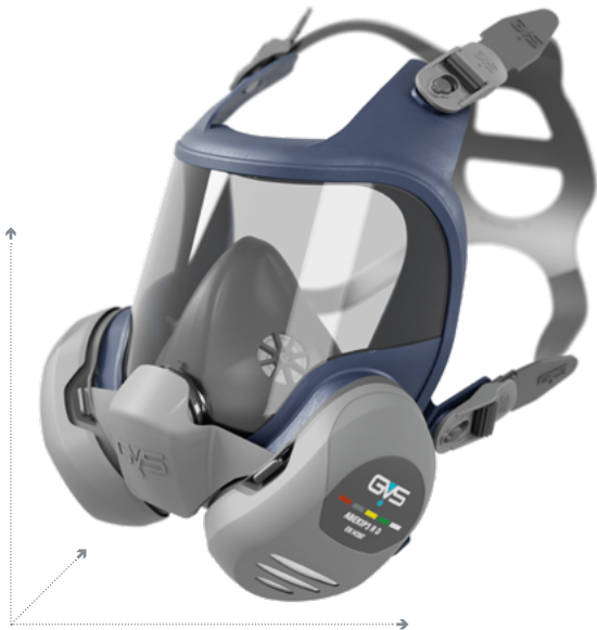
H: 178 mm D: 130 mm W: 166 mm