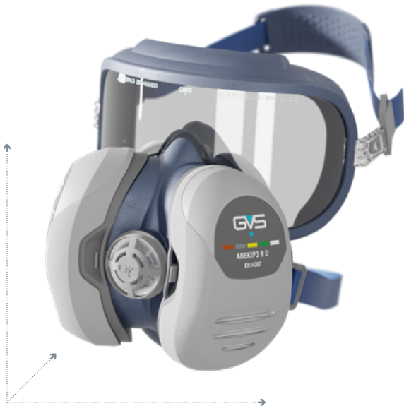
H: 166 mm D: 99 mm W: 143 mm