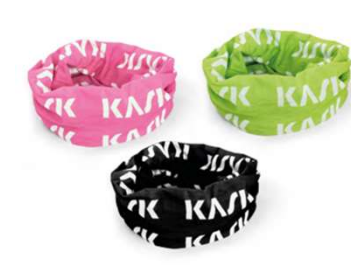
XME0011 NECK GAITER