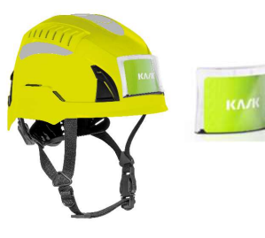
WAC00048 BADGE HOLDER